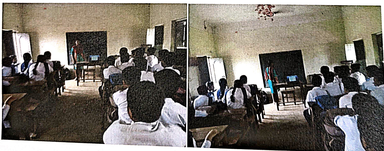
Fig 1: My performance in the classroom to aware the student about the Antibiotics and Antibiotic Resistant bacteria.